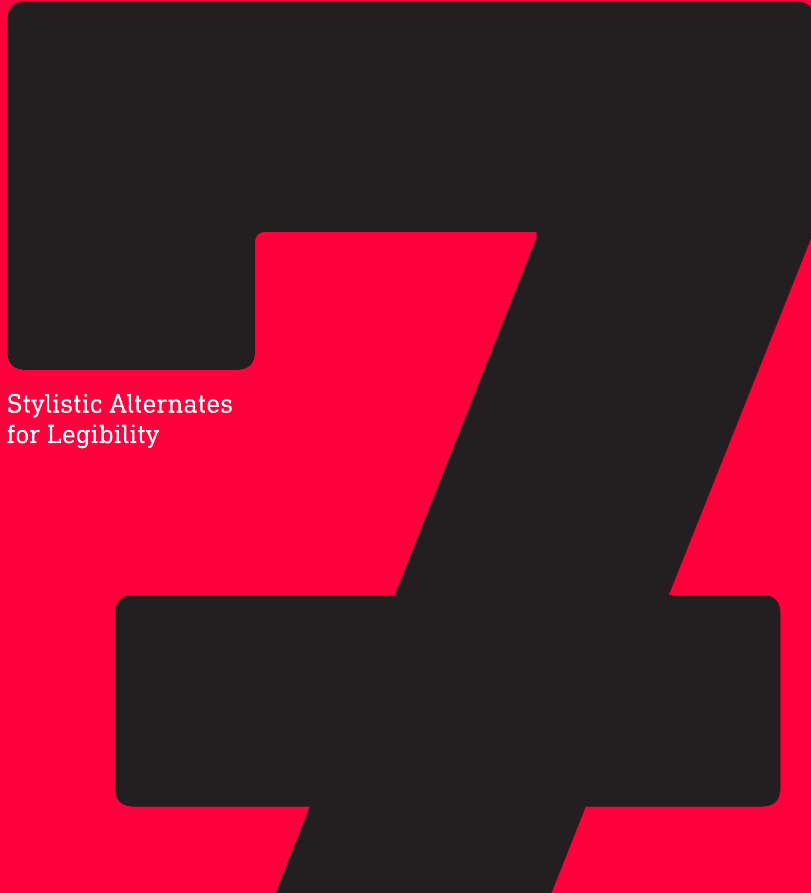
Stylistic Alternates for Legibility